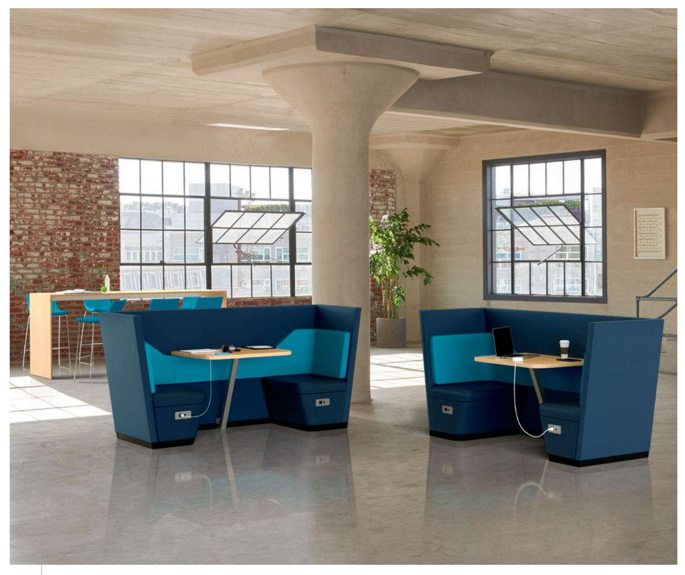
#6510-65TS-PB1 Public Lounge Models with Integrated Tables and Seat-Mounted Power Band 1 Units