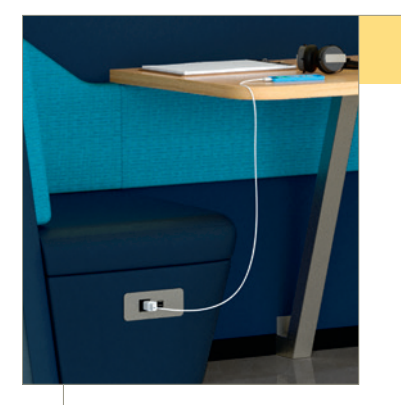
Convenient power options make it easy to plug-in and recharge.